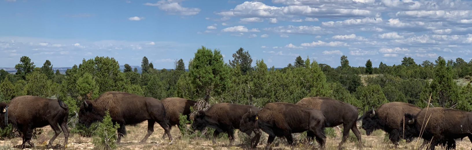
Bison running along Seep Ridge Road