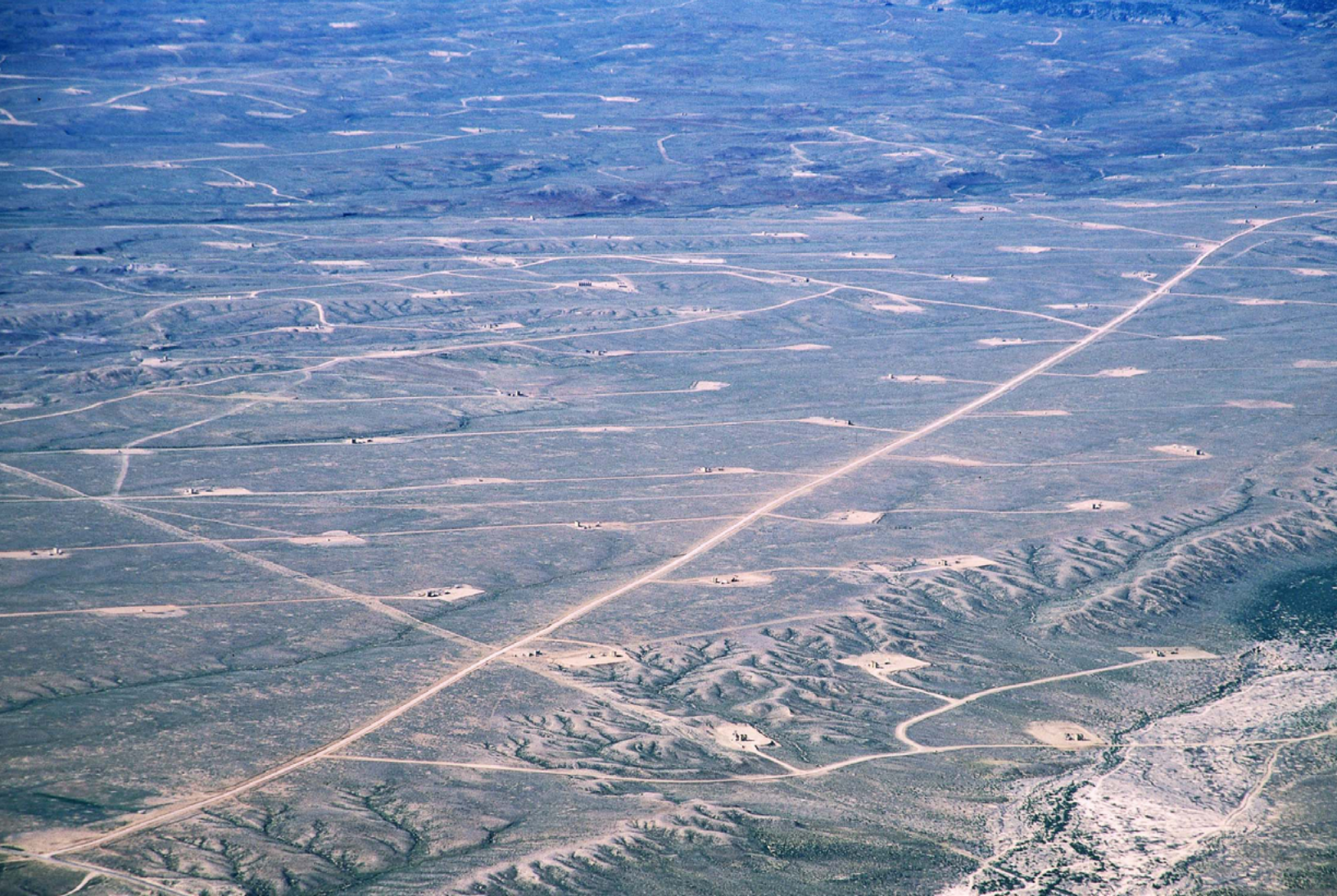
Uinta Basin drill pads